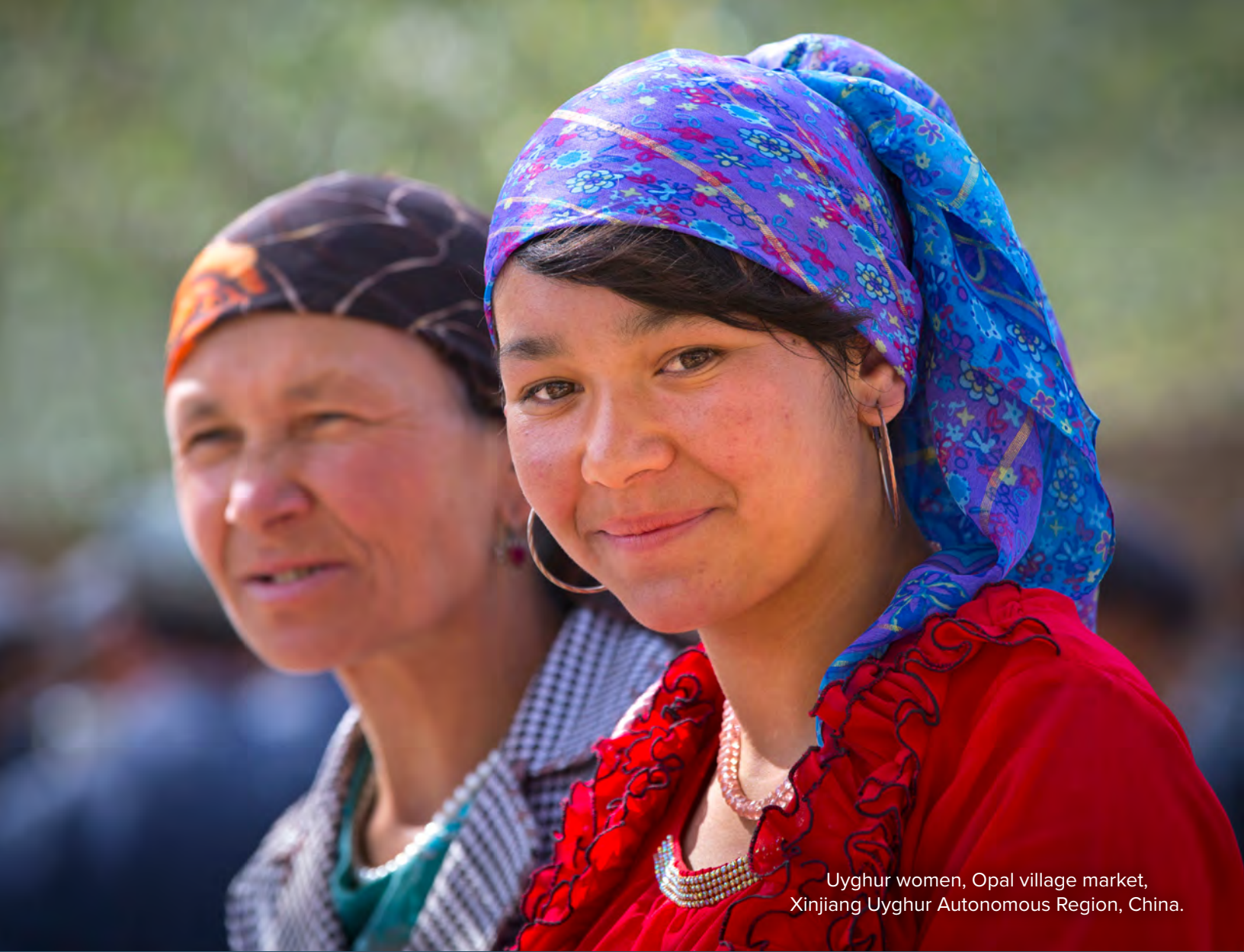
Uyghur women, Opal village market, Xinjiang Uyghur Autonomous Region, China.