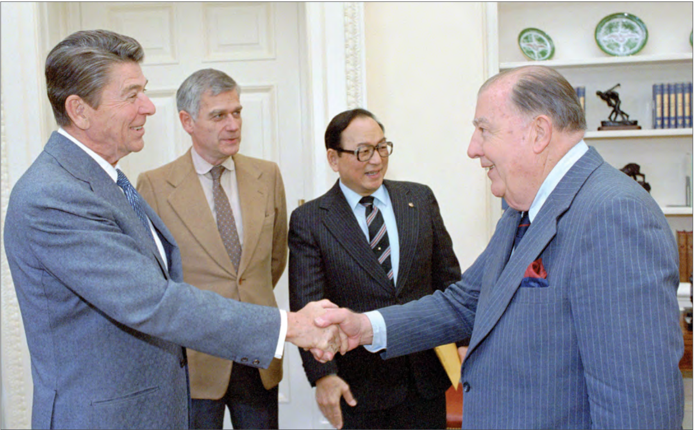
Senators Mark Hatfield of Oregon, Spark Matsunaga of Hawaii, and Jennings Randolph of West Virginia greet President Ronald Reagan, who signed USIP's founding legislation in 1984. Hatfield and Matsunaga, who worked with Randolph and bipartisan co-sponsors to establish the Institute, were motivated by their World War II combat experiences to create USIP as a way to strengthen America's capacity to reduce and prevent costly wars abroad.